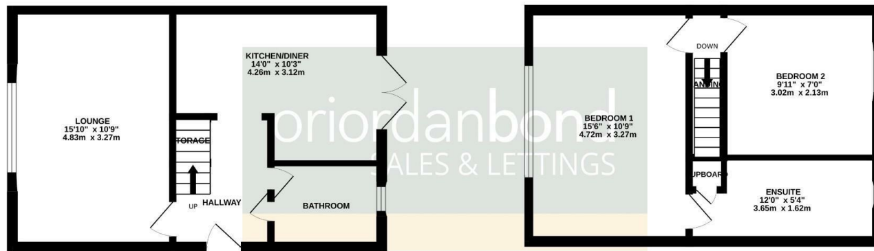
1ST FLOOR 361 sq.ft. (33.6 sq.m.) approx.

TOTAL FLOOR AREA : 753 sq.ft. (69.9 sq.m.) approx.