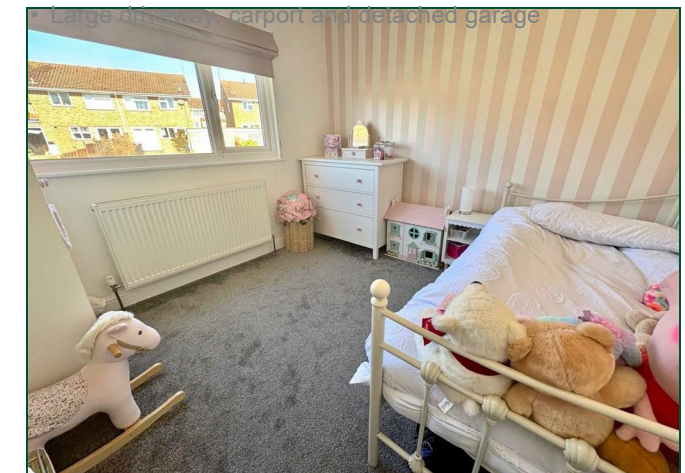
Large driveway, carport and detached garage